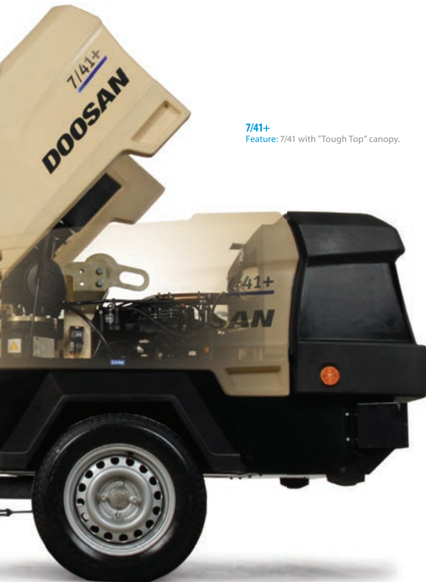
7/41+ Feature: 7/41 with "Tough Top" canopy.

Serviceability is excellent, with easy access to all maintenance points . All areas have been carefully designed for ease of inspection, maintenance and repair. Service intervals for different compressor components have been rationalized to reduce associated costs for the customer and increase utilization in the plant hire industry.